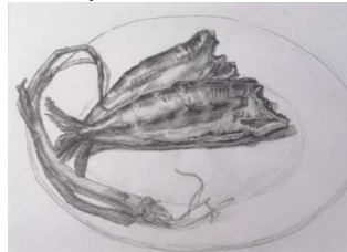
2B & 3B pencils, A5