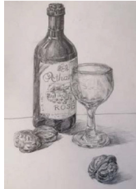
2B & 3B pencils, A5

To begin with, a couple of tablewares, containers and different types of food were selected to produce the observational drawings. The sources are mostly done in 2B and 3B pencils instead of paints, as in the early stage pencils will allow me to learn and develop my drawing skills more thoroughly. Also, the drawings of exploring different objects and the types of food helps me to find out objects that I would like to further develop and include in my final composition.