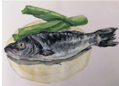
Acrylic paint on A4 card