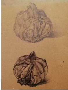
Study of garlic 2B&3B pencils and black biro on brown paper