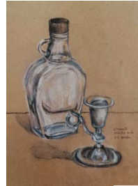
Charcoal pastels and oil pastels on brown paper

Experimenting new media - charcoal pastels and oil pastels. The media could easily help to create the translucent or shiny materials of the containers, however not ideal for handling details.