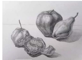
2B & 3B pencils A5