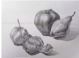
2B & 3B pencils A5