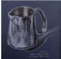
Colour pencils on prussian blue card

Experimenting new media - charcoal pastels and oil pastels. The media could easily help to create the translucent or shiny materials of the containers, however not ideal for handling details.